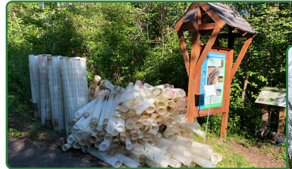
L: Empty tree tubes at the preserve entrance R: Dead ash trees