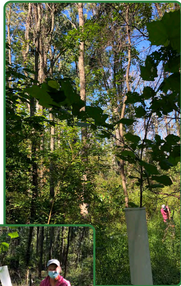
R: Young tree sprouting from tree tube